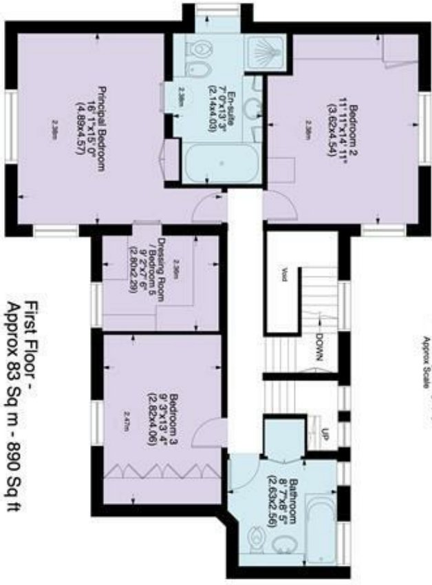
First Floor - Approx 83 Sq m - 890 Sq ft

Not to Scale, for guidance only and must not be relied upon as a statement to fact. All measurements are approximate only (and have been prepared in accordance with the current edition of the RICS Code of Measuring Practice).