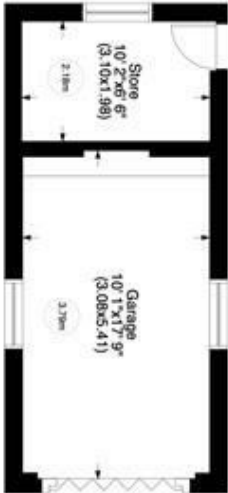
Ground Floor - Approx 23 Sq m - 251 Sq ft