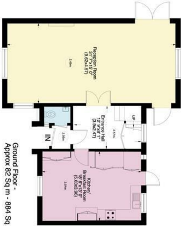
Ground Floor - Approx 82 Sq m - 884 Sq ft