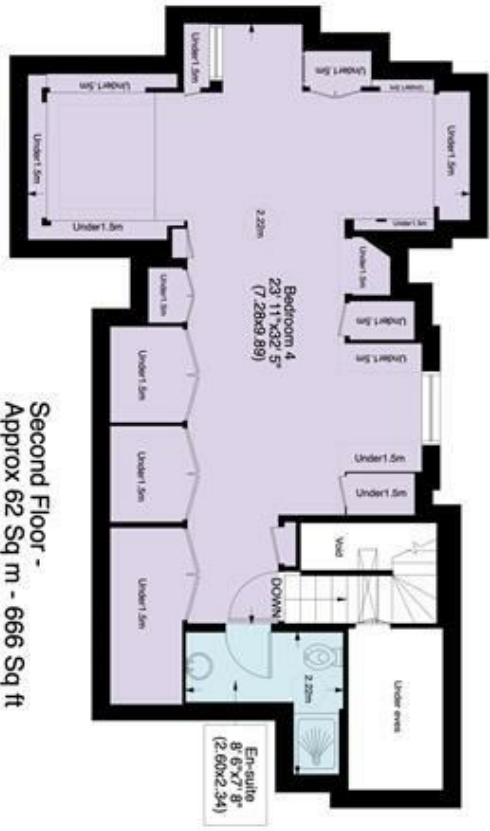
Second Floor - Approx 62 Sq m - 666 Sq ft